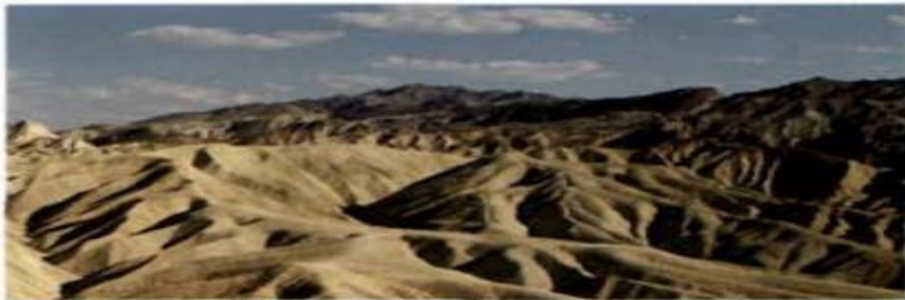
Death Valley (California, USA)