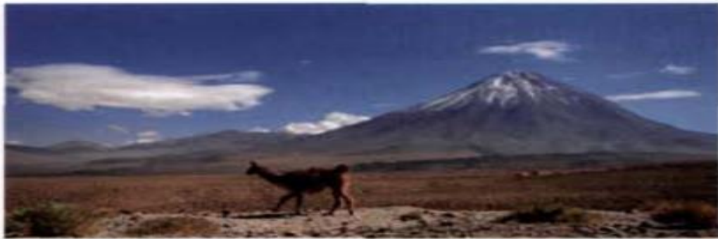
Atacama Desert (Chile)